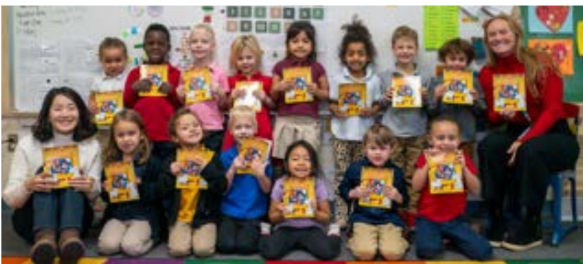
Our youngest students received new Christmas storybooks, thanks to our generous donors.