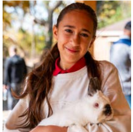
6th/7th grade Wonder Academy hosted its annual Wonder Zoo, where younger students viewed exhibits on Michigan wildlife and plant life.