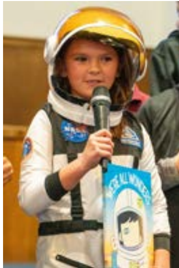
At our annual Book Day, students dressed up as book characters and shared with elementary students.