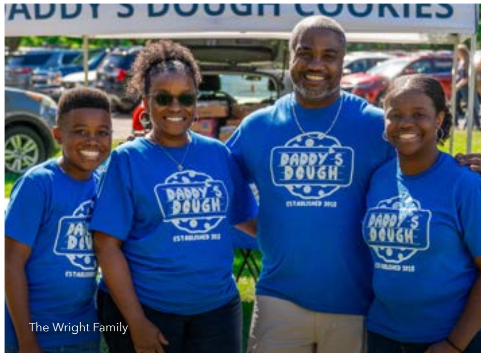
The Wright Family