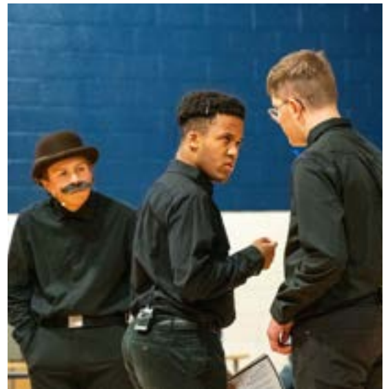
The high school theater company performed Our Town for our community.