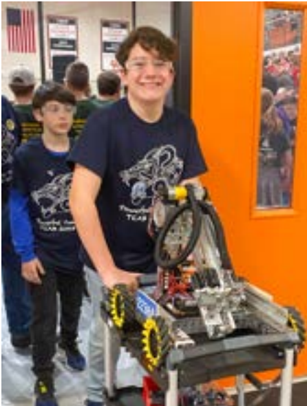
Our middle school robotics club participated in a competition and took a field trip to Chicago.