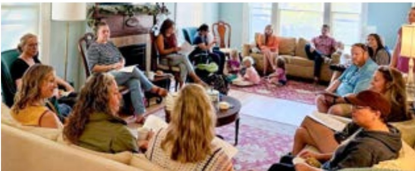
A new weekly TPH parent book club formed and parents studied The Anxious Generation first semester.